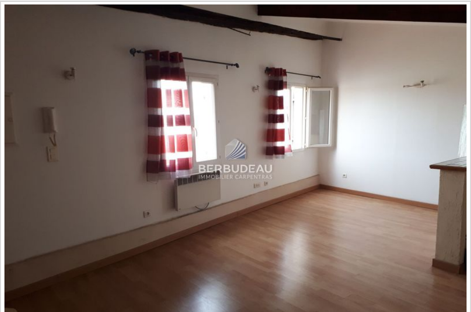
Apartment 884 Carpentras